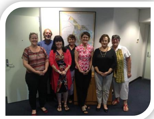
Some of the Grow Well Live Well Leadership Group members

Children attending were often shy about responding but were helped by their parents. There were 29 responses to the questions, "What makes you happy about growing up in Palmerston?" with families indicating that they enjoyed and appreciated attending activities, groups, events and having access to great parks. There were 26 responses to the question, "What makes you sad growing up in Palmerston?" with most responses focusing on safety issues from crime, anti-social behavior and a need for more shaded areas. Other needs included better access to public amenities, more specialist services and more opportunities for community participation.